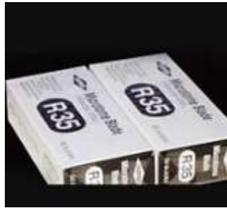
E31.8008 Microtome Blades Feather Brand