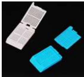
E31.8006 Embedding Cassettes