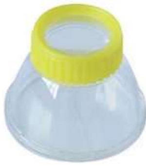
E31.5501 Insect Box