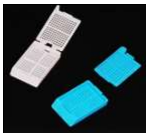
E31.8007 Embedding Cassettes "O" Type Ring